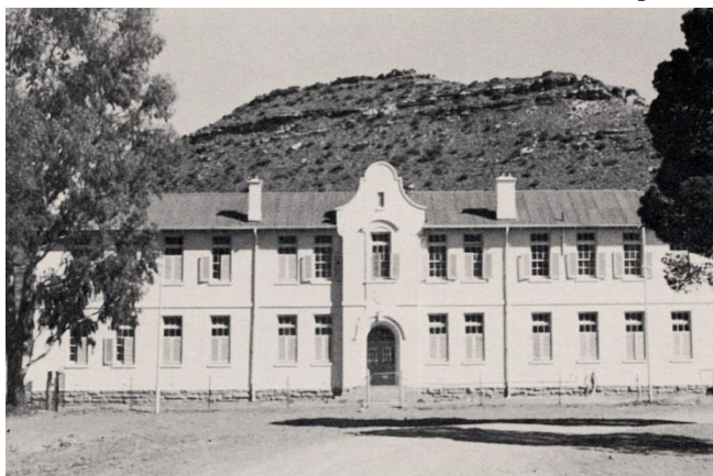
The Steynsburg Teachers Training College which was erected in 1913, where 850 teachers were trained in the following 37 years. This contributed to successful school education in Afrikaans country wide over the following 100 years

It became clear that this was not a normal CNE-school, but in fact a church school. The school commission would consist of representatives of the parents (the