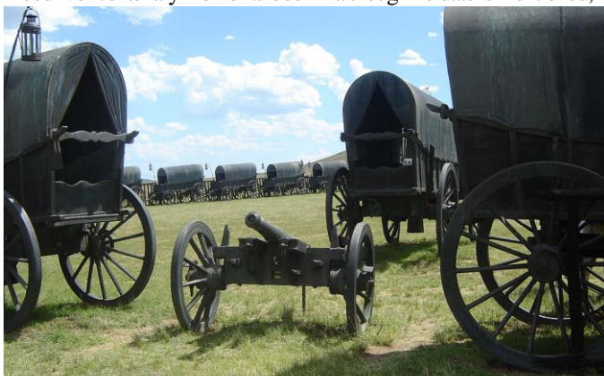
The reconstructed Boer lager, made from bronze iron, which was erected during 1971 on the terrain of the Battle of Blood River

I also found these facts in the Voortrekker Archival documents, published in 1937 and the Bloodriver centenary memorial book – although no date is mentioned, it was most probably 1938.